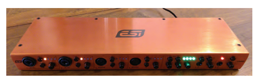
While ESI Audiotechnik is a virtual unknown amongst pro audio types. I expect that will soon change with products like the U168 XT on its roster.

The software control panel for the U168 XT is simplistic, clean and intuitive, offering detailed and useful metering, clock source and input and output selection parameters. Following a quick setup taking no more than a minute or two, I was up and running