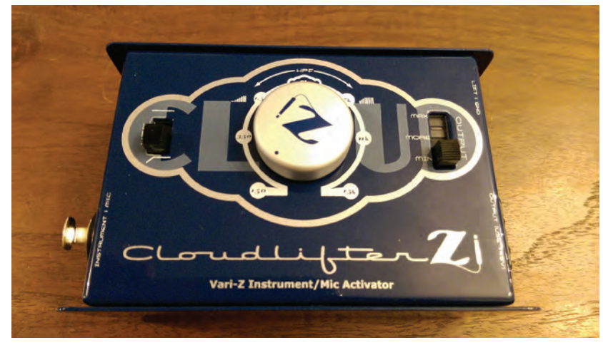
The Cloudlifter CL-Zi is a well-built, steel-chassis box featuring a variable impedance knob and HPF to allow tone shaping through the manipulation of impedance loading.

I/O includes a combo XLR/quarter-inch input and XLR output, the latter of which should be paired with 48 V phantom power. The CL-Zi features a three-position gain switch, allowing for minimum gain (3 dB/ instrument, 6 dB/mic); more gain (6 dB instrument, 12 dB mic); or the